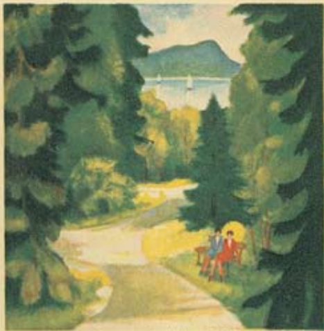
View from the Hotel Grounds