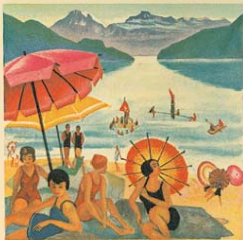
The Bathing Beach June to September