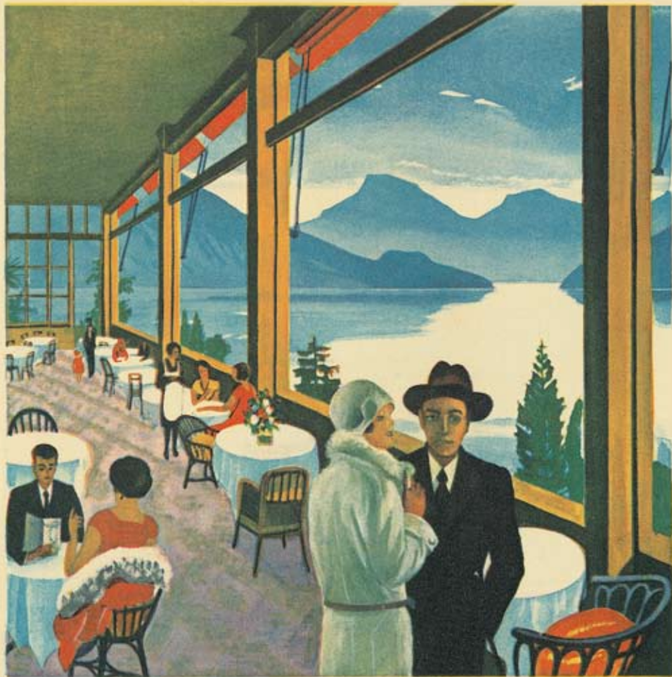
A wide panoramic view of the blue Lake of Lucerne and of a circle of majestic mountains is obtained from the terrace and from most of the rooms.