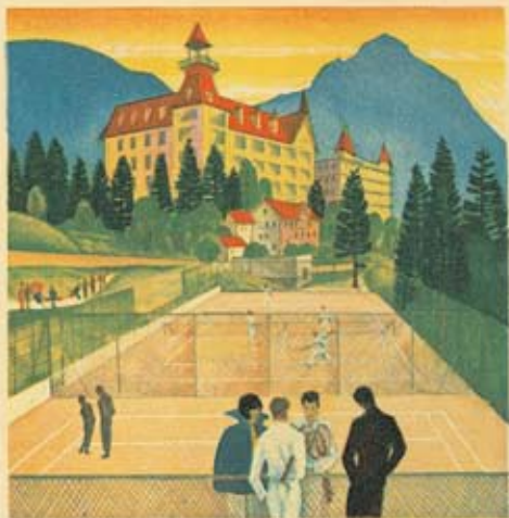
Public Tennis Courts