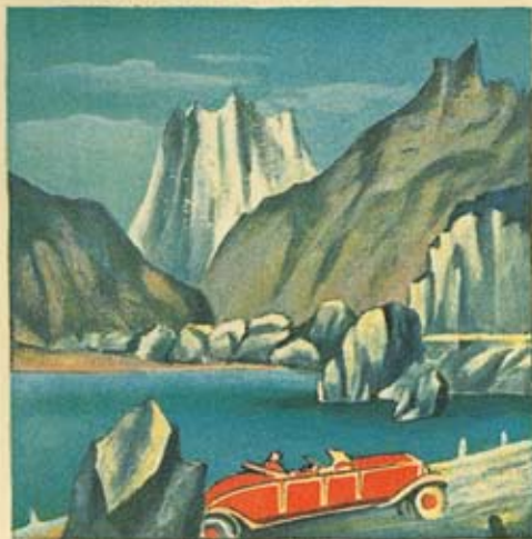
Excursions to Alpine Regions